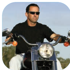
Perfect for the outdoors, NOSK removes dirt and allergens from the air.