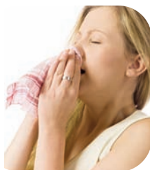
Allergy sufferers breathe easy with NOSK . No more sprays and medications to worry about!